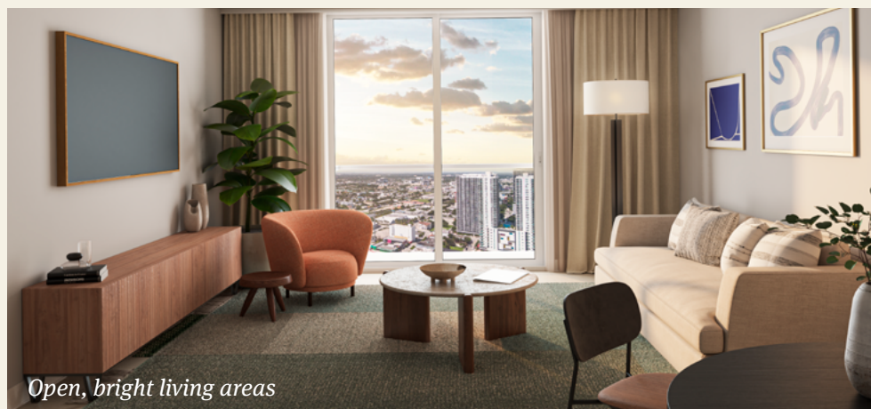
Open, bright living areas