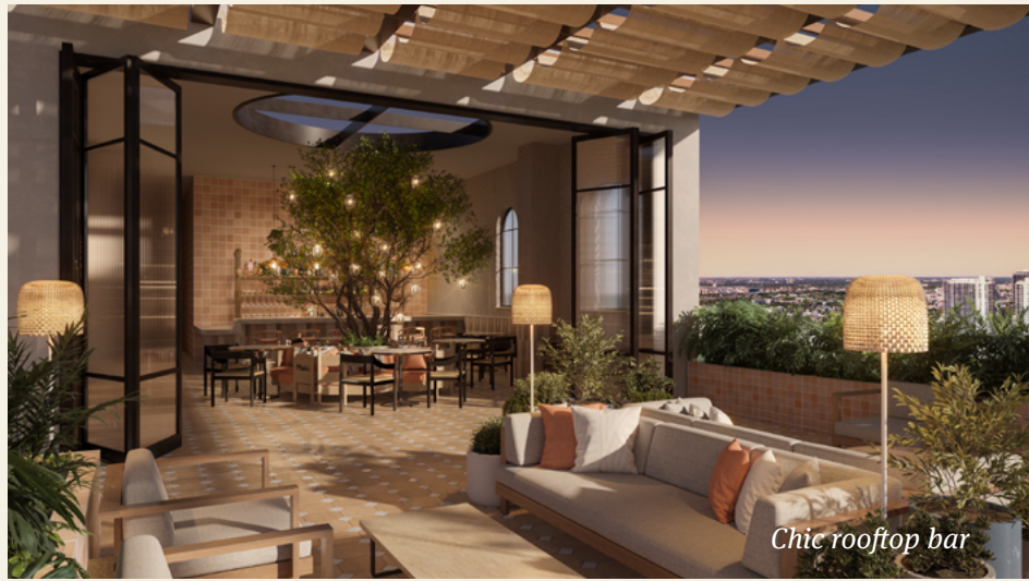
Chic rooftop bar