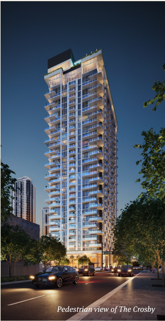
Pedestrian view of The Crosby

The Crosby ushers in a new dynamic Miami lifestyle where the city's best dining, shopping and recreation is just a short walk away.